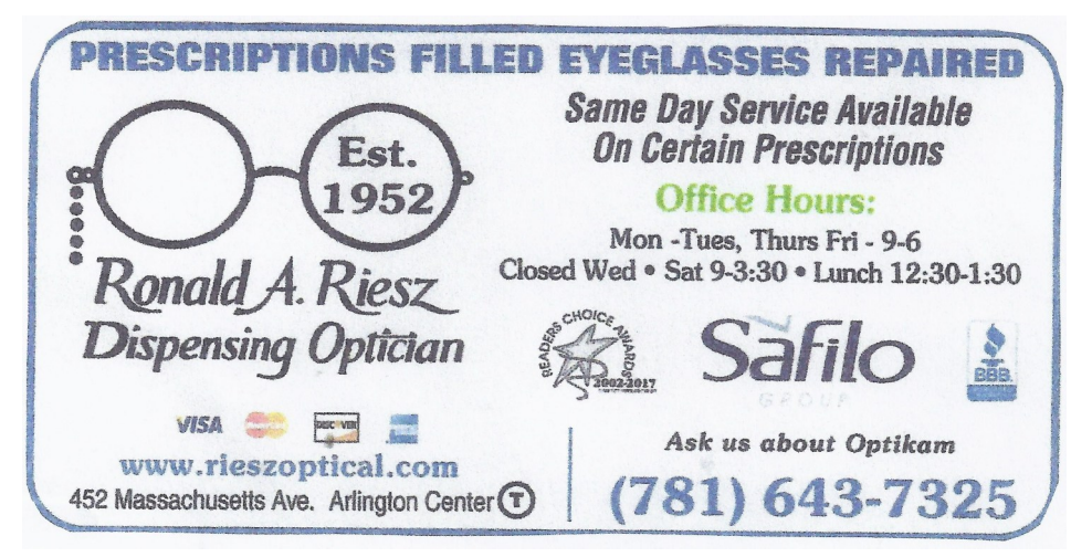
10% off for LWVA members and their families