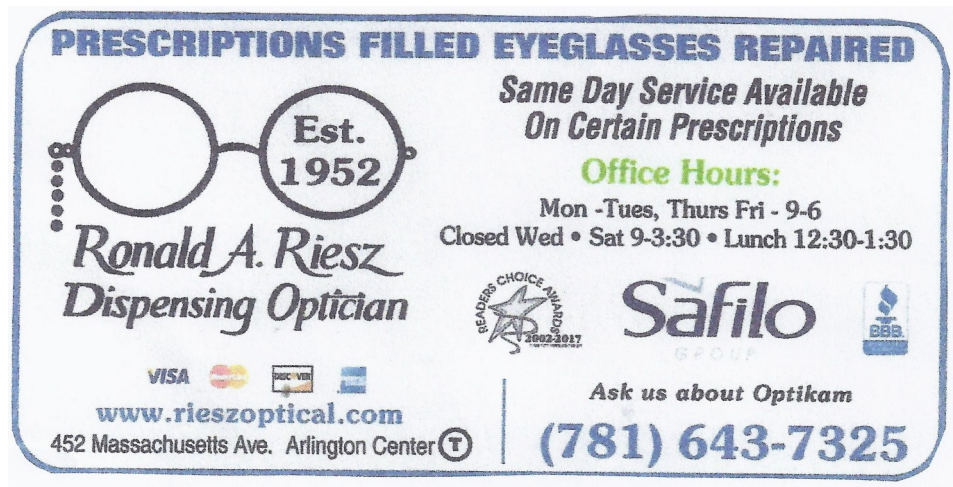
10% off for LWVA members and their families